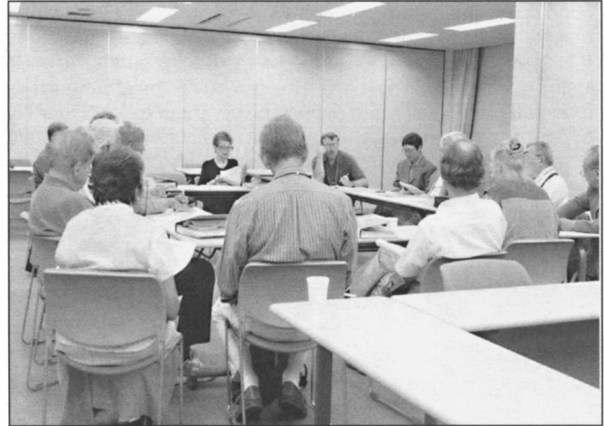
Fig. 1: Meetings of the Executive Council.