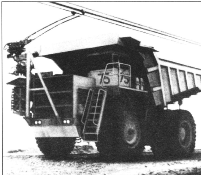
Fig. 4: Trolley truck operating at the Quebec Cartier iron ore mine, Lac Jeannine, 1970s.

vehicles do not need energy to carry their fuel. The low energy intensities of tethered vehicles, for passengers and freight, suggest that extensive use of them should be considered as part of the preparation for an era of energy constraints.