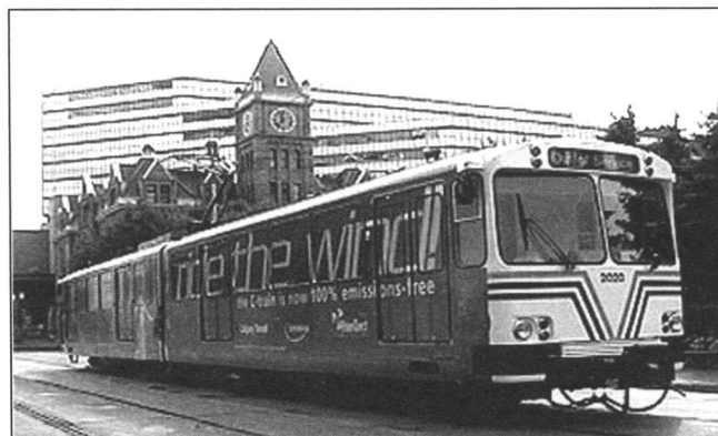
Fig. 3: Calgary's LRT system is fuelled by wind energy.

The ability of tethered vehicles to use renewable energy is illustrated in figure 3, which shows one of Calgary's light-rail trains, running with the slogan “Ride the Wind.” The slogan is justified by Calgary Transit's annual purchase of 26 gigawatt-hours of electricity from a wind farm, equivalent to 100 percent