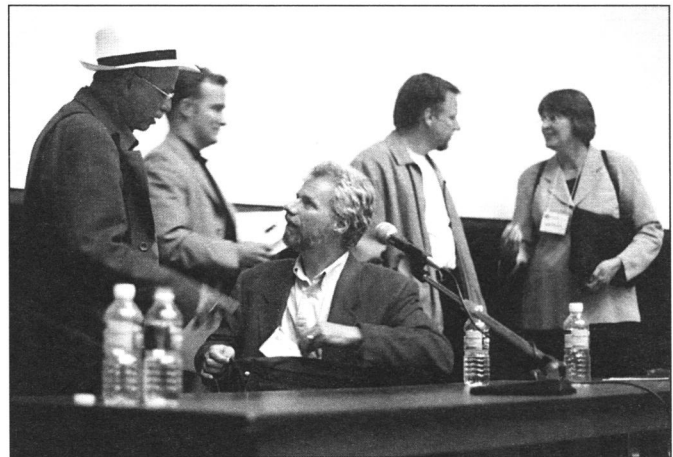
Figs. 1-4: Participants, faculty and university staff constantly busy even during breaks with rare exceptions, of course ... (see fig. 5).