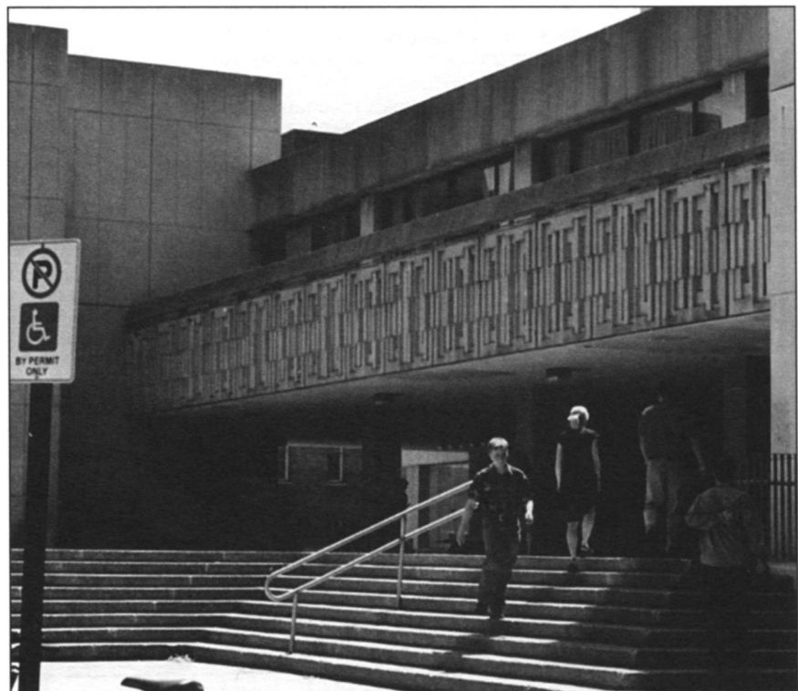
Fig. 2: Entrance of the Medical Sciences Centre building where the Symposium took place.