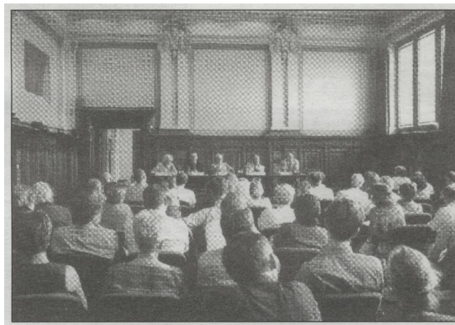
The Wissenschaftszentrum Berlin main lecture hall.