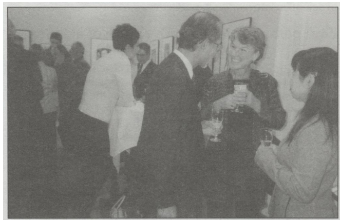
Reception/Cocktails after the C.A. Doxiadis Lecture